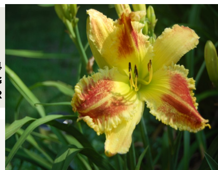
Pins & Needles RICE-JA 2010

NEDS Meeting - Saturday, November 10, 2018 at Tower Hill Botanic Garden Room C (downstairs) Boylston, MA