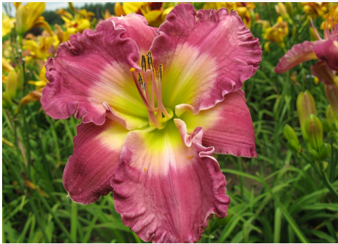
Maureen Strong- Culver-B. 2016 34" MLa 6" SEV TET 25 buds 4 branches Ruffled bright lavender mauve with a large green throat.