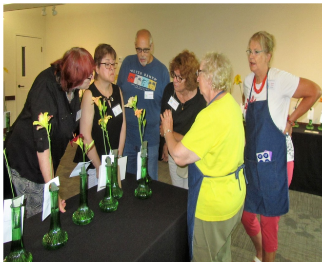
Judges evaluating daylilies