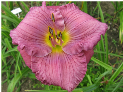
Blue Ransom - Culver-B. 2016 37" MLa 5" SEV TET 26 buds 4 branches Bluish mauve blend with a darker same colored eye and edge above a green throat