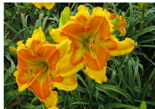
Dragon Nation - Culver-B. 2014 36 E 6.5" SEV TET 15 buds 3 branches Large flowered yellow gold with a bright saturated red eye and edge above a green throat.