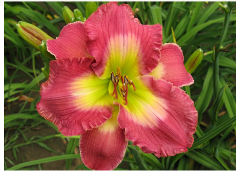
Melanie's Smile - Culver-B. 2009 36" MLa 5.5" SEV TET re 25 buds 4 branches Ruffled rose red with a light white watermark above a large green throat