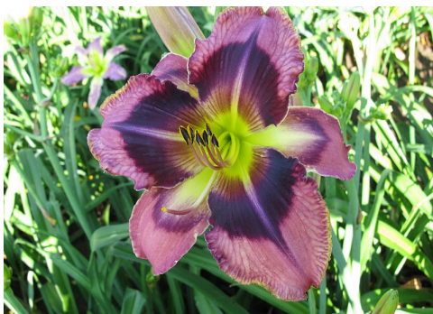
David White - Culver-B. 2014 38" MLa 6" DOR TET 20 buds 3 branches Lavender mauve with a clear bright purple eye with veining in the throat.