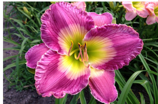
David Mussar - Culver-B. 2017 32" MLa 5.5" SEV TET 30 buds 4 branches Lavender mauve blend with lighter water-mark above a bright green throat .