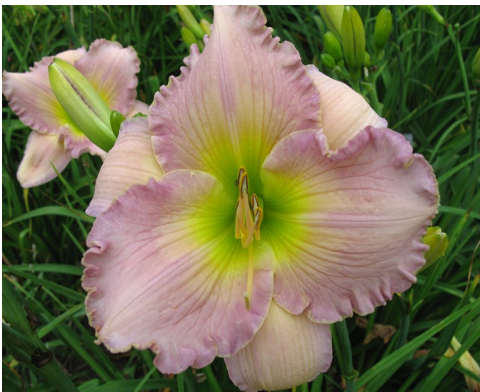
Alice Harman - Culver-B. 2016 36" MLa 6" SEV TET 24 buds 4 branches Bright ruffled clear mauve with a bright green throat