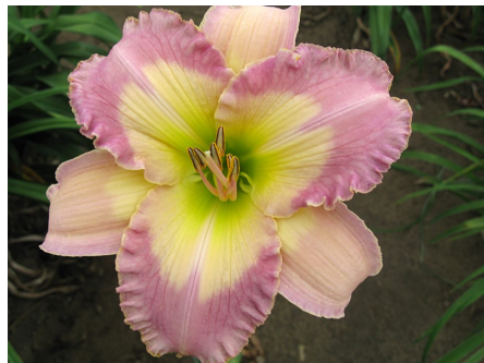
Brooklyn - Culver-B. 2017 32" MLa 6" SEV TET 24 buds 4 branches Clear baby ribbon pink with large white water-mark above a bright green throat.