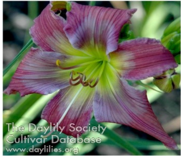
Ed Kraus—McCutcheon 2014 — 33" EM 5" SEV DIP grape purple with an iced metallic lavender eye and edge