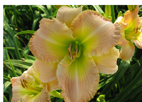
Killarney Road - Culver-B. 2013 36" MLa 6" SEV TET 20 buds 3 branches Light baby ribbon pink with a ruffled gold edge above a very large green throat