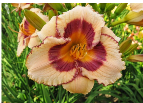
Eyepod - Culver-B. 2009 42" MLa 4" SEV TET re 25 buds 4 branches Cream white with wine purple eye and ruffled edge