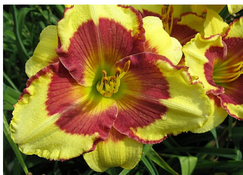
Electric Circus - Culver-B. 2008 28" EM 5" SEV TET 15 buds 3 branches Bright lemon with prodominate rose red eye and edge above green throat. .