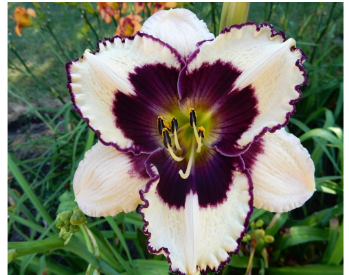
Bird's Eye View — Culver-B. 2017 35" MLa 5.5" SEV TET 25 buds, 4 branches ruffled cream white with black purple eye and edge.