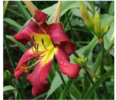
WHIP CITY SLINKY WIGGLE, Lori-Ann Jones '07

Twisting , 35 inches tall, 5 ½ flower as is, 7 ½ inches stretched. 3 way branching with a 15 BC. Pod & pollen fertile and very limited. This daylily has grace with its curling and twisting and I just love it. Hope you do too!